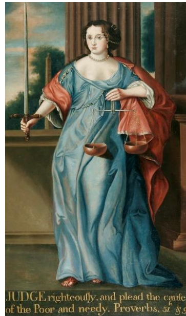
Portrait of Justice (1792) John Theodrick Norwich Castle Museum

Here, the scales symbolise fair and equal law and the sword symbolises the power of the law.